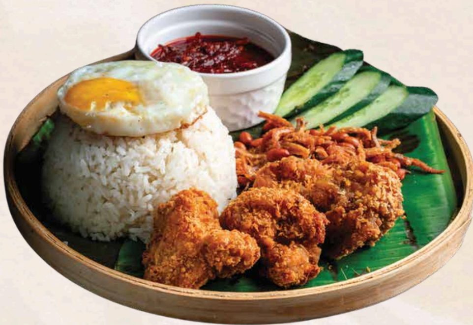
NASI LEMAK AYAM GORENG CRISPY