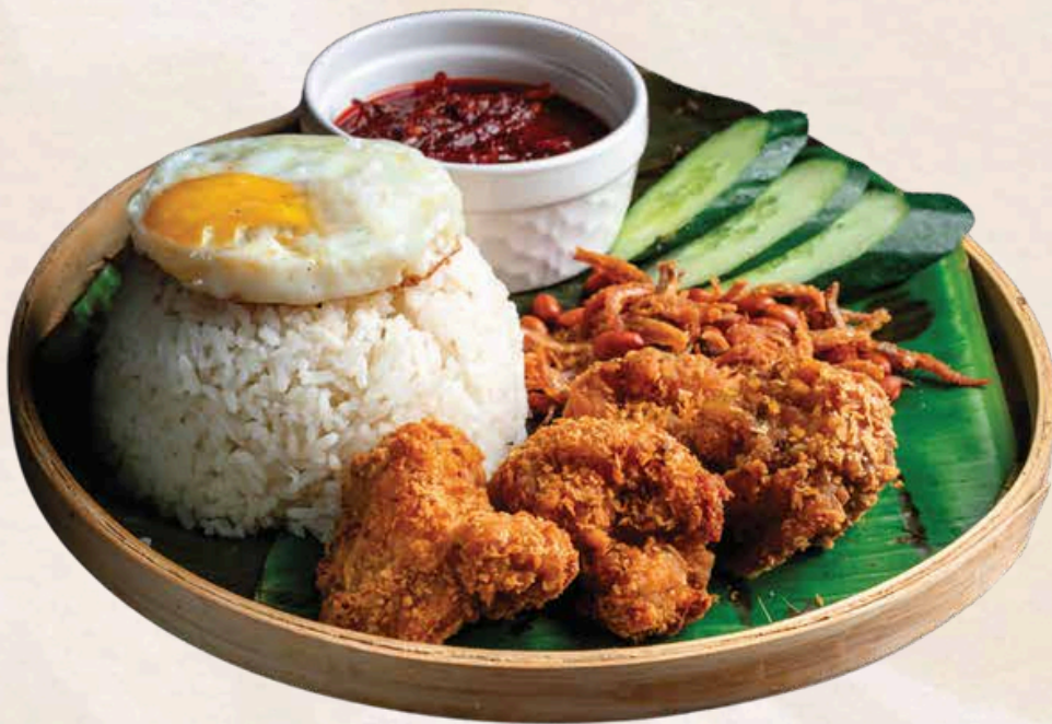
NASI LEMAK AYAM GORENG CRISPY