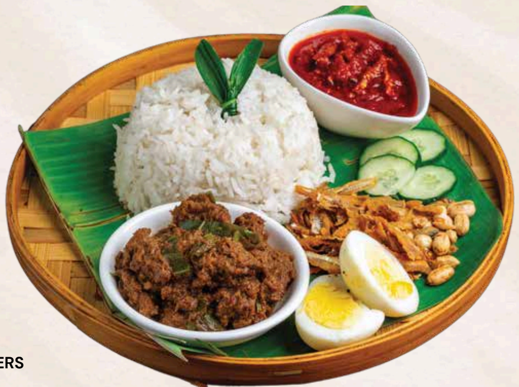
NASI LEMAK BEEF RENDANG